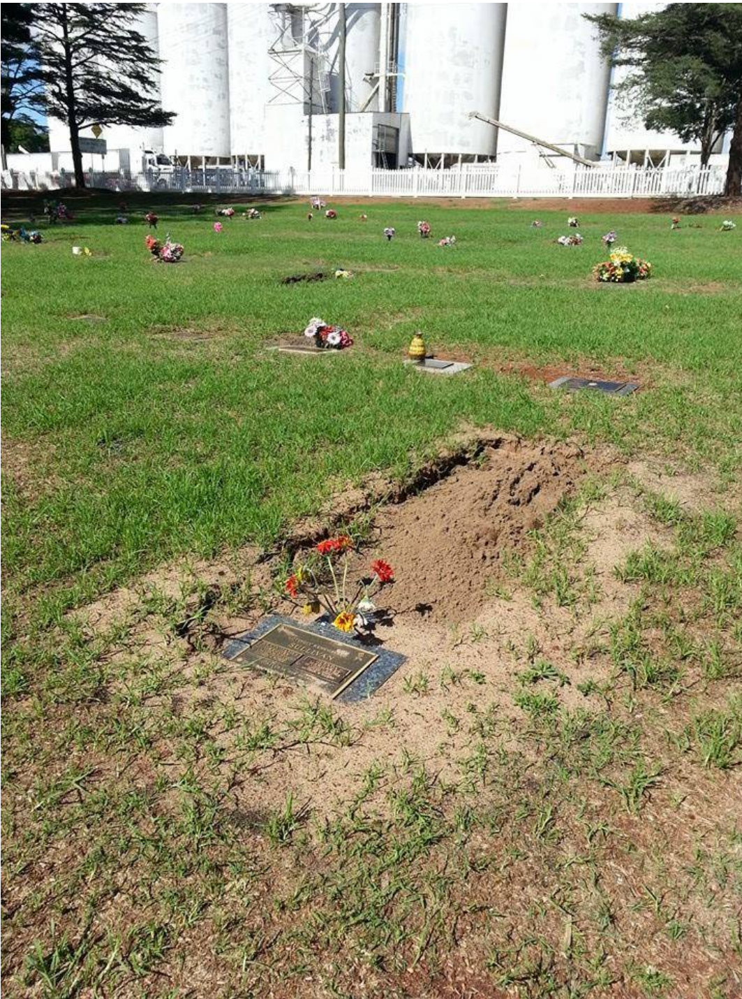
A sinking grave at the Toowoomba and Drayton Cemetery.

"I wouldn't let my mother visit dad's plot in this condition," he said.