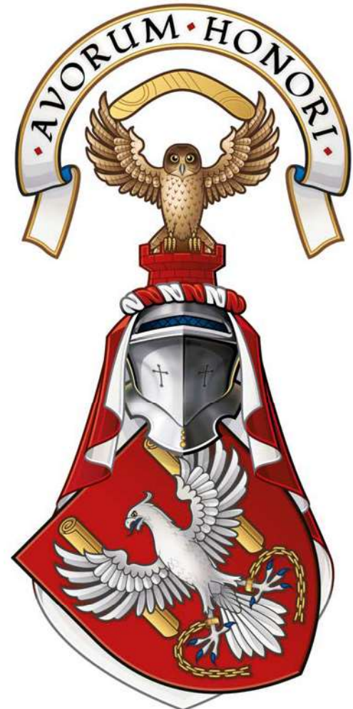
Art Nouveau digital rendition of Coat of Arms (displayed Couché, or diagonally orientated, shown above) granted to me by Her Majesty's College of Arms: London; 2019.